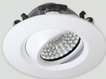
SL112T ULG clear glass Beam 20° 40° 60° Task | General lighting