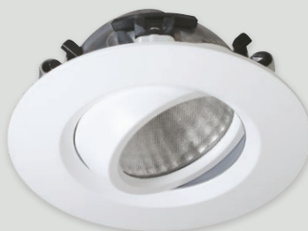
SL111T Prismatic diffuser Beam 20° 40° 60° General | Task lighting