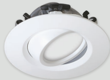
SL113T Opaque diffuser Beam 90° Wide angle lighting